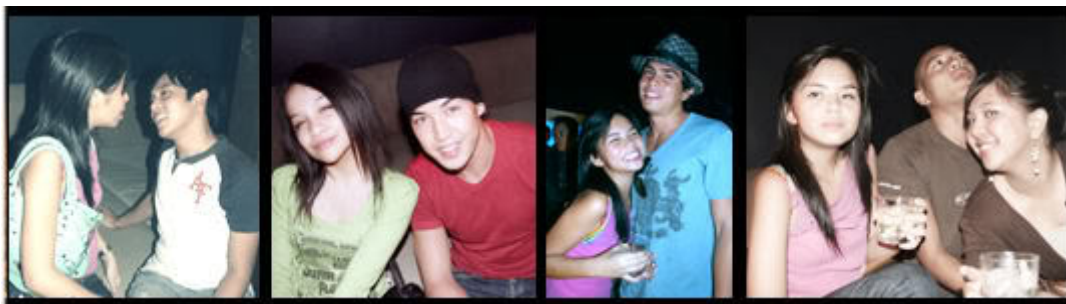
a night out in manila

Modern Filipino courtship revolves more on the liberalism of Filipino youth. If Filipinos of opposite sex were not allowed to mingle in public in the old days, these days that is already possible. These has allowed courtship to be a little more lenient on youngsters. You can now meet a girl you like through a common friend or on a party but never on a street as the same is still regarded as inappropriate.